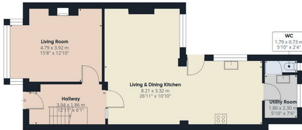
Floor 0 Building 1