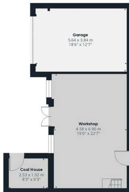
Floor 0 Building 2