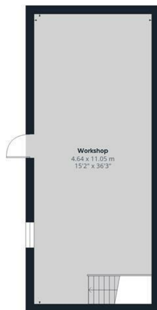
Floor 1 Building 2