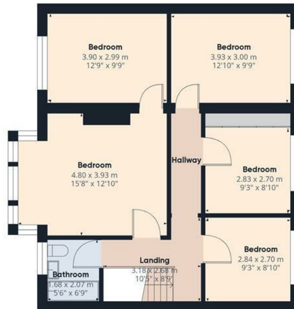
Floor 1 Building 1