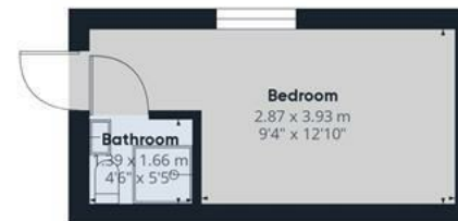
Floor 0 Building 2