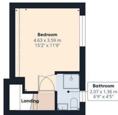
Floor 2 Building 1